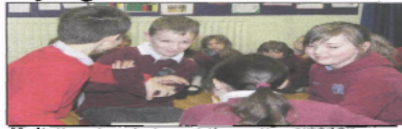
Mediation steps in to sort the matter. NC0702aw

It is managed by the NIEI and monitored by a Project Steering Group representing the following educational partners: NIEI, Education and Library Board (NIEI), the Council for Catholic Maintained Schools (CCMS), the Northern Ireland Council for Integrated Education (NICIE) and Catholic as well as Protestant (Cant). It aims to develop cross community partnerships for sustainable success.