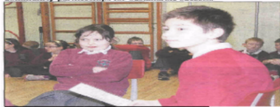
Taking part in discussions. NC0700aw